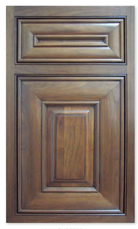
MANCHESTER Inset Signature Wheaton with Black Highlight on walnut