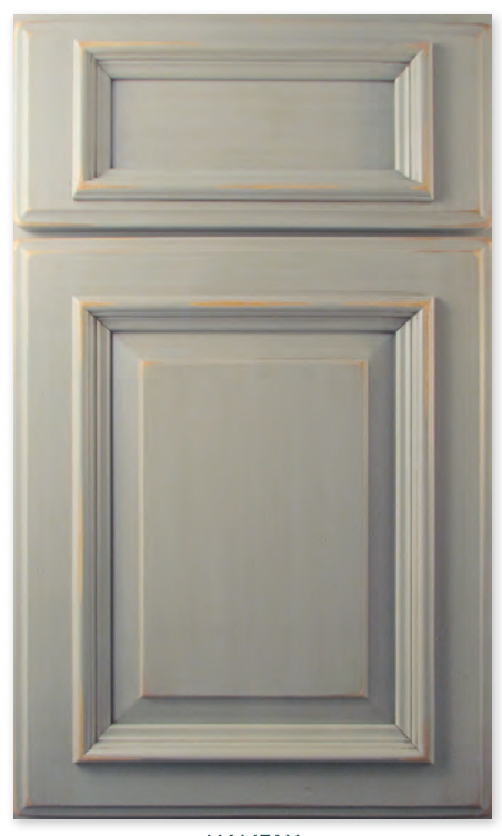
HALIFAX Signature Terra Taupe with Van Dyke Brown Brushing, distressing and heavy wearing on maple