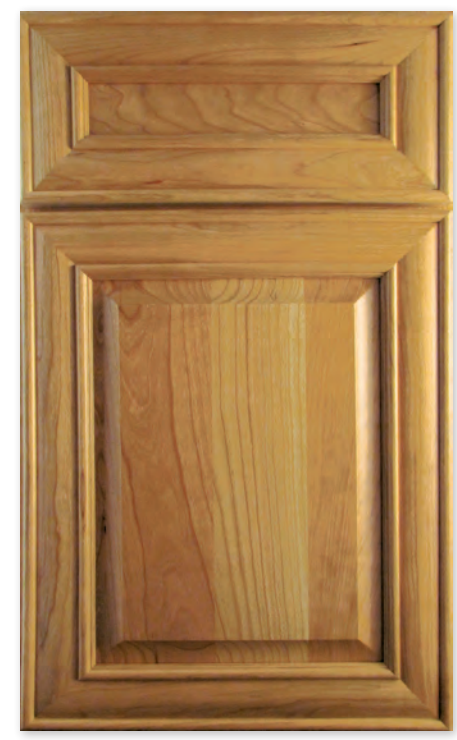
KENSINGTON Williamsburg Yellow on cherry