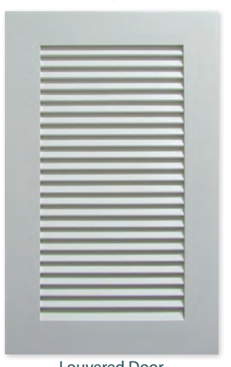
Louvered Door Shown in Designer White paint