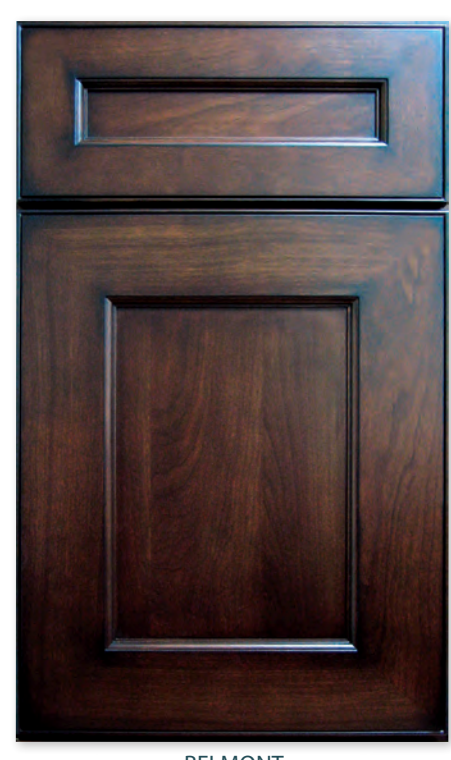
BELMONT Truffle on cherry