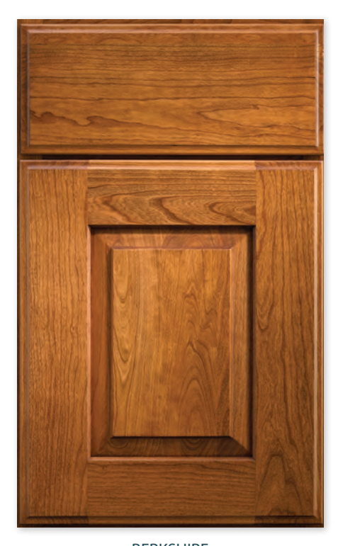
BERKSHIRE Wheaton on cherry