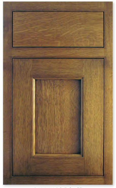
BANNING [1" thick] Goldenrod on quarter-sawn white oak