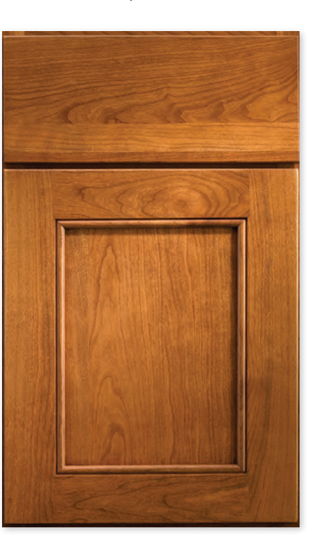
BROOKINGS Wheaton on cherry