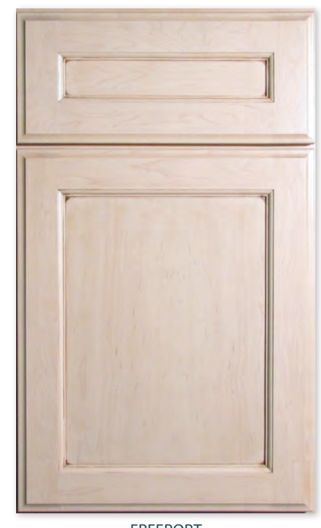
FREEPORT Signature Classic White with Van Dyke Brown Highlight on maple