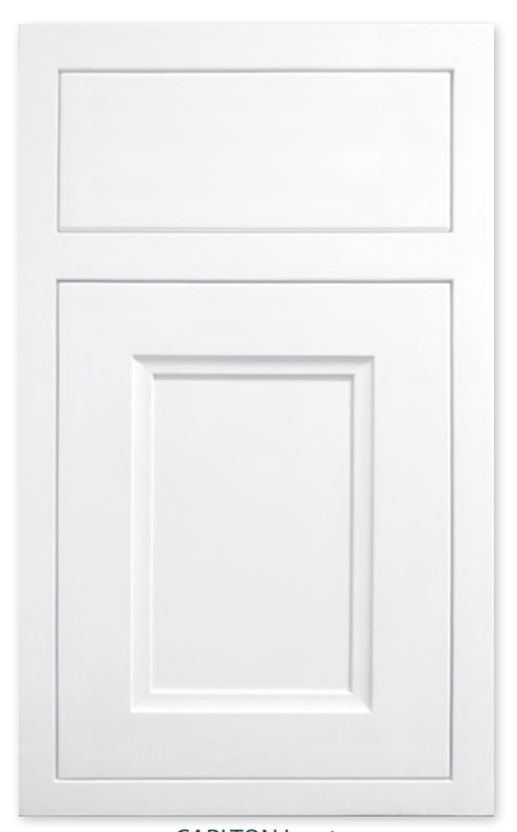
CARLTON Inset Designer White on PGM