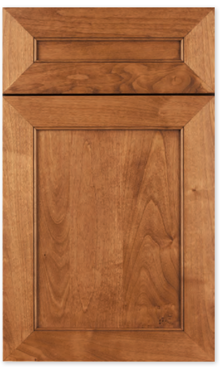
RIDGEWAY Honeytone on premium alder