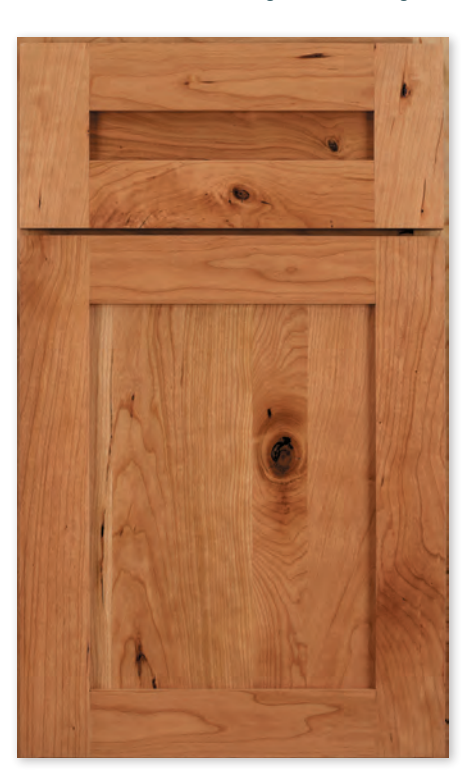
REGENT Breezewood on rustic cherry Also available: Regent Roman