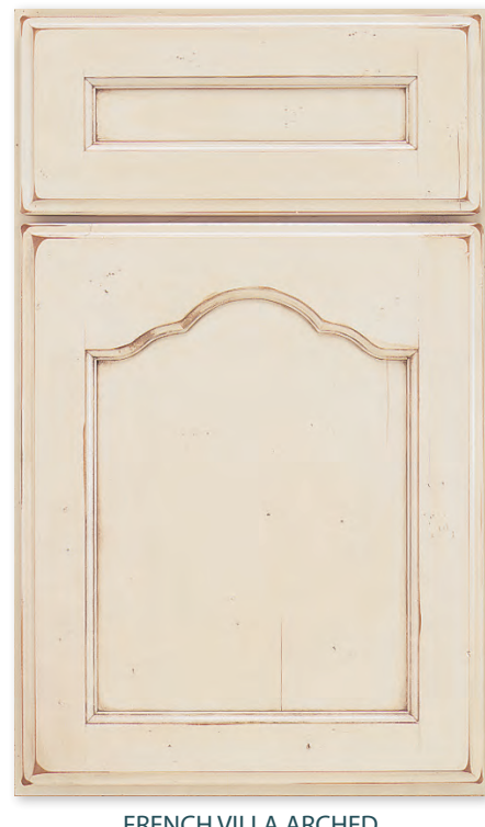
FRENCH VILLA ARCHED Signature Antique White with Van Dyke Brown Highlight, wearing, distressing and cracking on maple