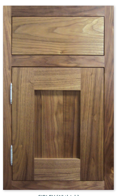
SIBLEY [1" thick] Natural on walnut [Shown with Brushed Nickel finial hinge.]