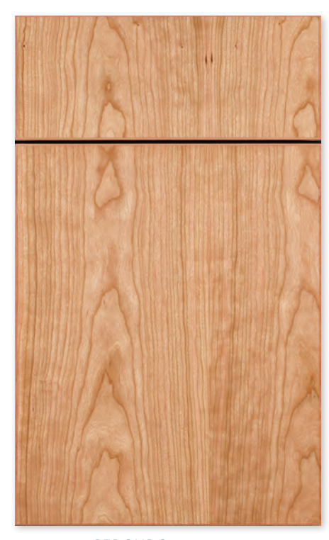
REDONDO CHAMFERED Natural on cherry