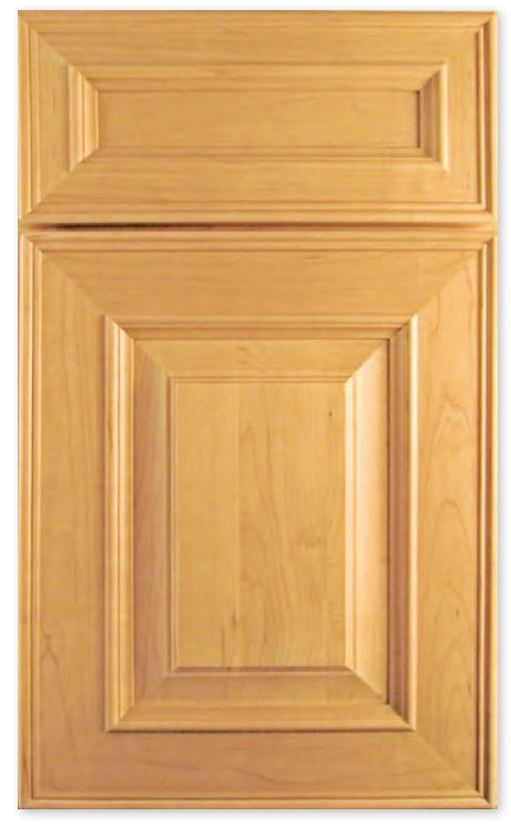
BRECKENRIDGE Breezewood on maple