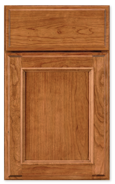
GREENFIELD Honeytone on cherry