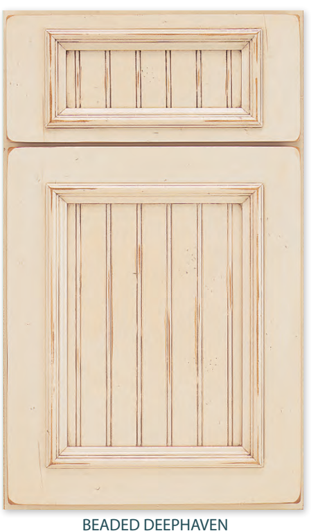
BEADED DEEPHAVEN Signature Antique White with Van Dyke Brown Highlight, wearing, distressing and cracking on maple