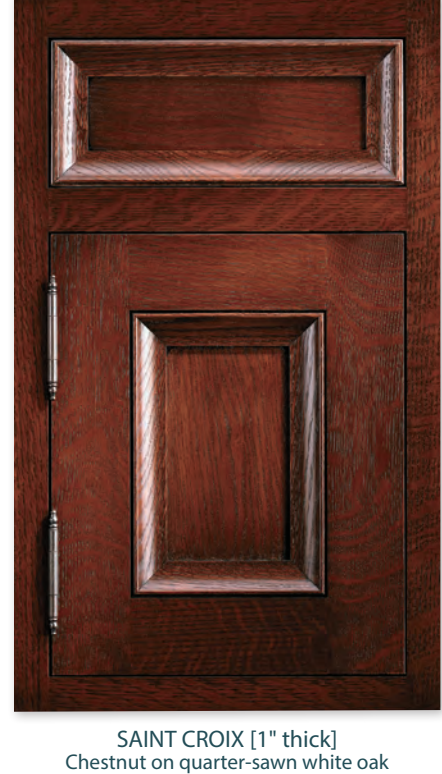
SAINT CROIX [1" thick] Chestnut on quarter-sawn white oak [Shown with custom finial hinge]