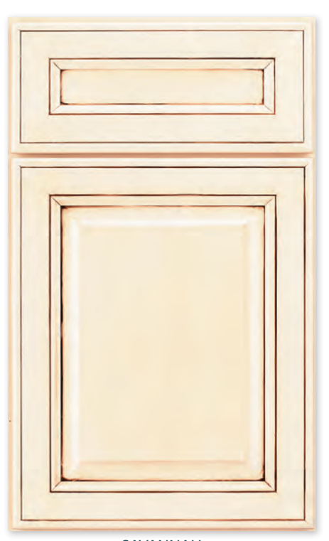
SAVANNAH Signature Frosty White with Van Dyke Brown Glazing on maple