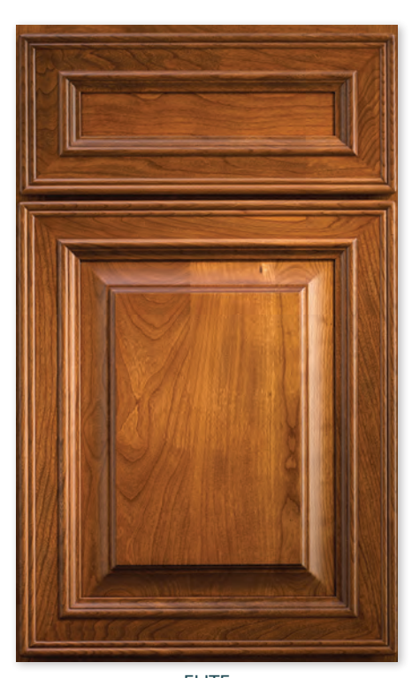
ELITE Wheaton on cherry