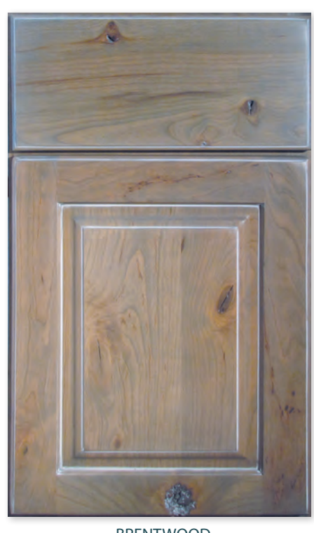
BRENTWOOD Signature Sunwashed Grey with White Glazing and wearing on rustic cherry