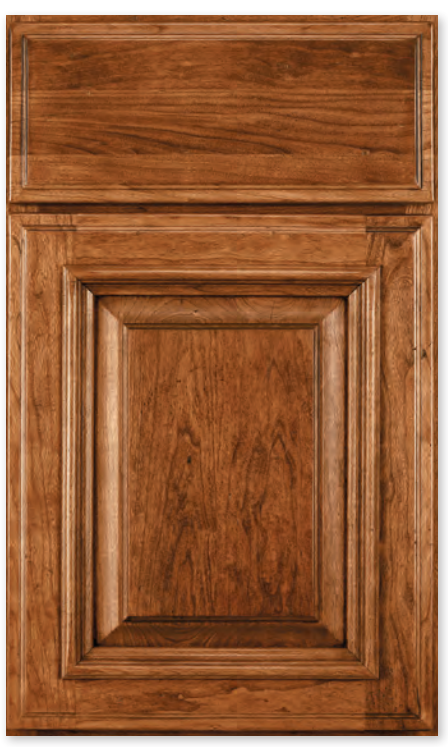
WINTHROP Signature Honeytone with Van Dyke Brown Highlight, distressing, cracking and worm holing on cherry