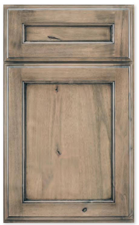
FRENCH VILLA SQUARE Signature Aged Cedar w/ Black Highlight on knotty alder