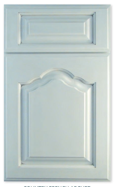
COUNTRY FRENCH ARCHED Signature Waterfall with Pewter Highlight on maple