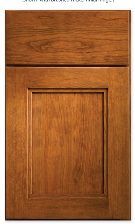
WAKEFIELD Wheaton on cherry