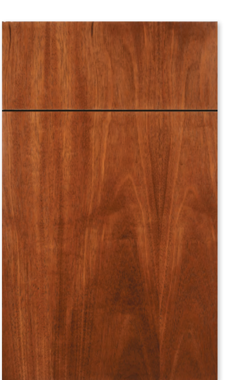
SPRINGFIELD Natural on special request African Mahogany veneer