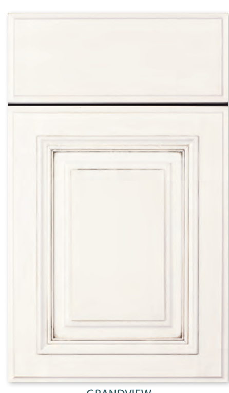
GRANDVIEW Signature Designer White with Pewter Highlight on maple