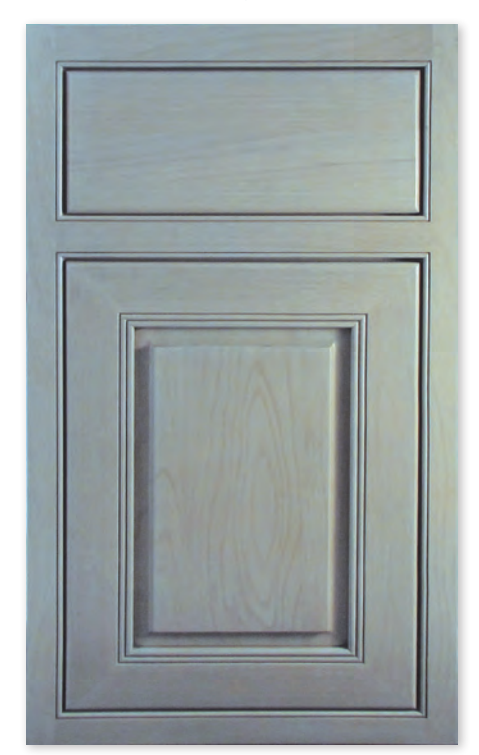
NANTUCKET Signature Cape Cod with Pewter Highlight on premium alder