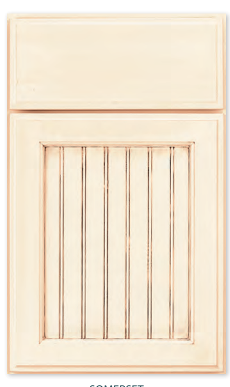
SOMERSET Signature Frosty White with Van Dyke Brown Highlight on maple