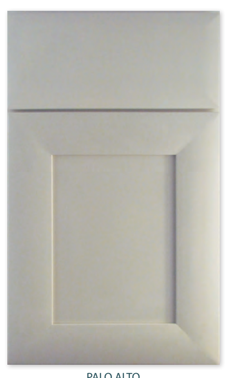
PALO ALTO Stone Bluff on PGM