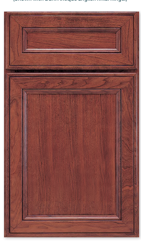
NEWPORT Cherry Hill on cherry