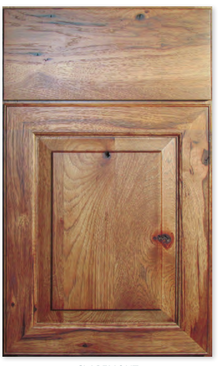
CLAREMONT Nutmeg on rustic hickory