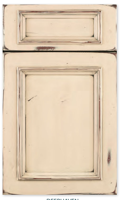
DEEPHAVEN Signature Rub-thru Antique White over Umber w/ Pewter Highlight, distressing, cracking & rasping on knotty alder