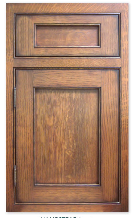
HAMPSTEAD Inset Burnt Copper on quarter-sawn white oak [Shown with Dark Antique English finial hinge.]