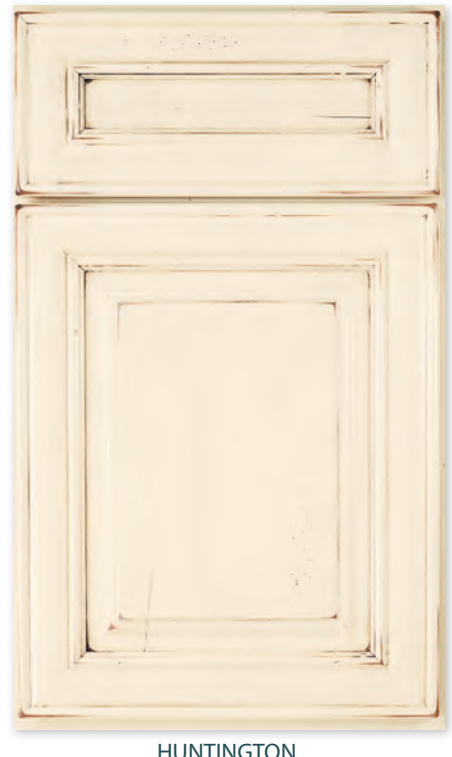
HUNTINGTON Signature Antique White with Van Dyke Brown Highlight, wearing, distressing and cracking on maple