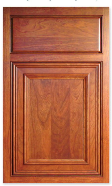
GALLERY Umber on cherry