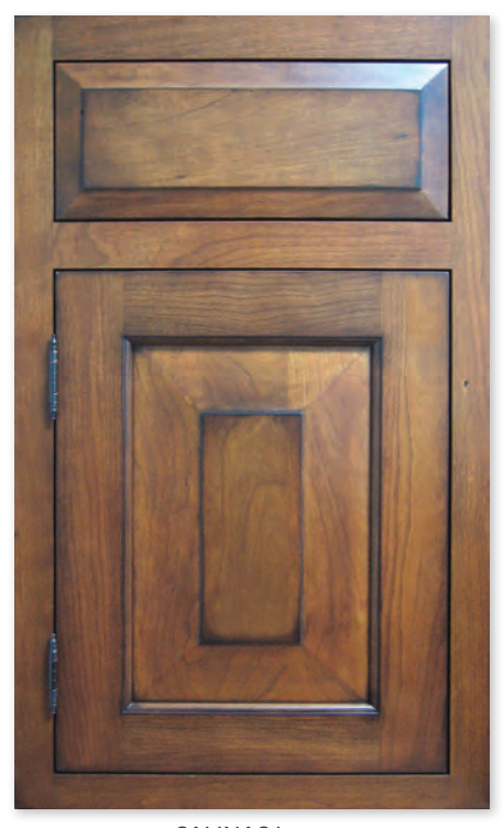
SALINAS Inset Amber on Cherry [Shown with Oil-Rubbed Bronze finial hinge]