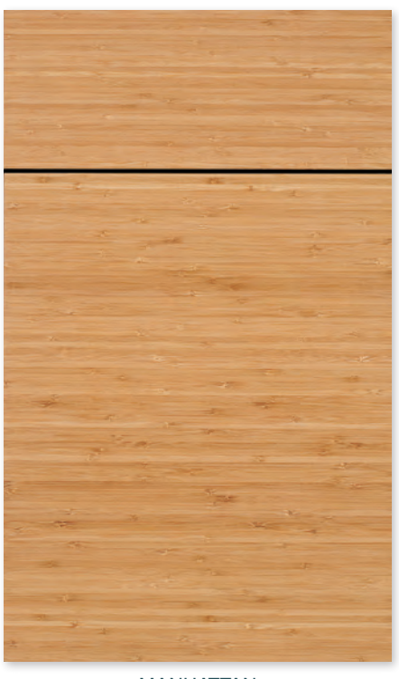
MANHATTAN Narrow Carbonized Bamboo