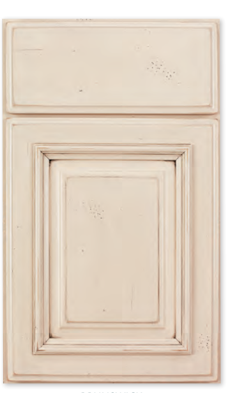
BRUNSWICK Signature Antique White w/ Pewter Highlight, wearing, distressing, cracking and worm holing on maple