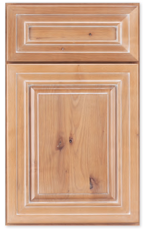
CATALINA Signature Williamsburg Yellow w/ White Glazing on knotty alder