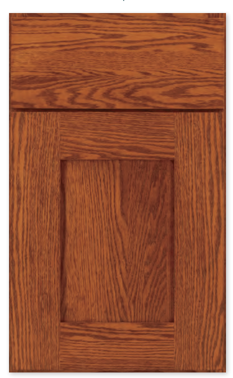
GENTRY Umber on red oak