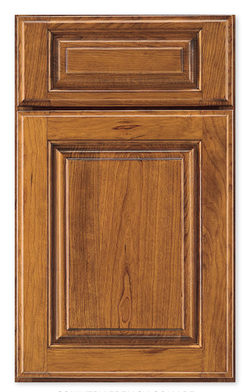
COUNTRY FRENCH SQUARE Nutmeg on cherry