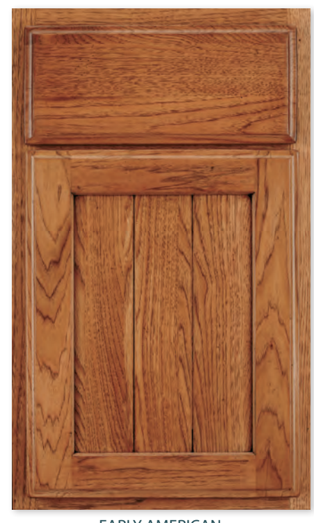
EARLY AMERICAN Signature Chestnut with Van Dyke Brown Highlight wearing, distressing and cracking on hickory