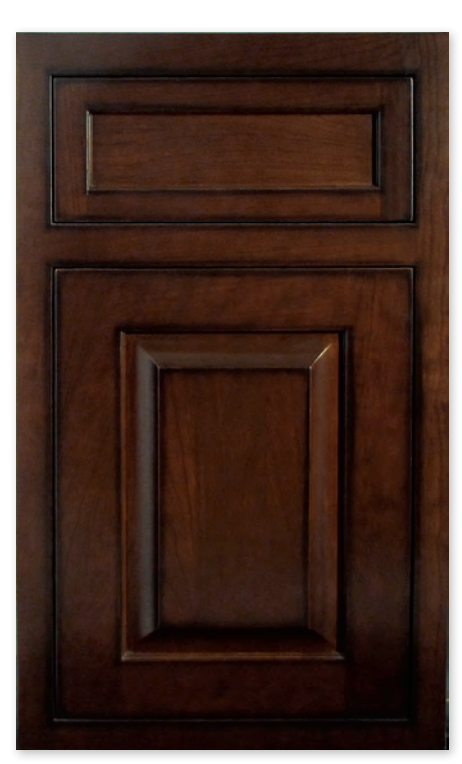
CAHILL Inset Truffle on cherry