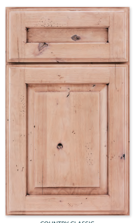
COUNTRY CLASSIC Signature Classic White with Van Dyke Brown Highlight, wearing, distressing and cracking on knotty alder