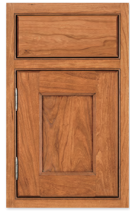
KATHIO WITH 3/4"THICK FRAME Honeytone on cherry [1" thick] [Shown with Sterling Nickel finial hinge]