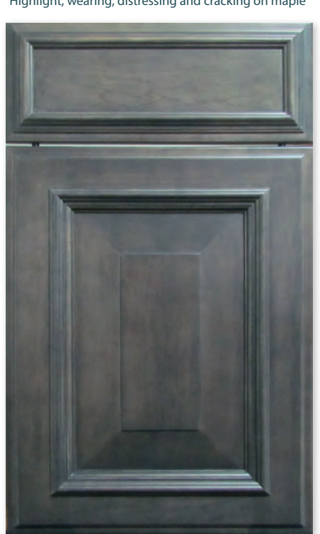
NORFOLK Slate on maple [Slate available on maple only.]