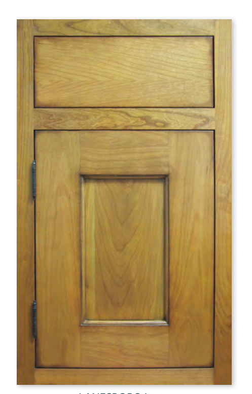
LANESBORO Inset Golden Rod on cherry [Shown with Wrought Iron finial hinge]