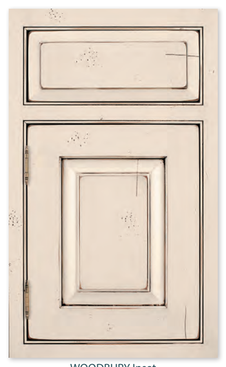
WOODBURY Inset Signature Bisque w/ Van Dyke Brown Glazing, wearing, cracking, distressing and worm holing on maple