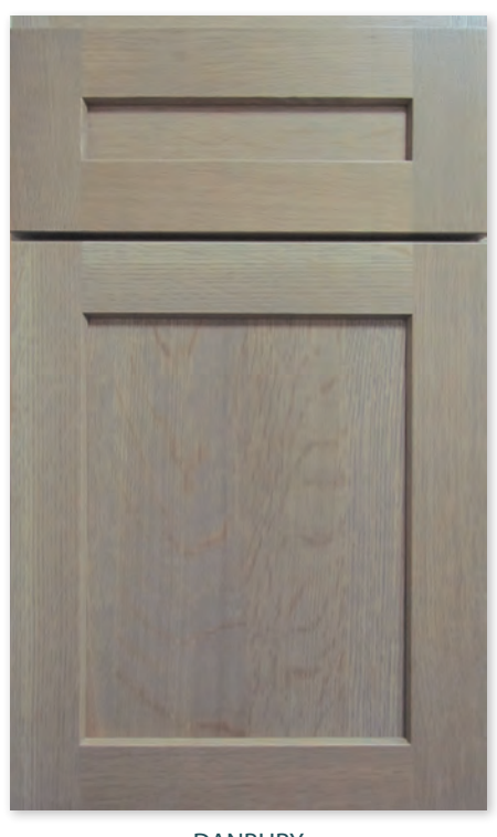
DANBURY Sunwashed Grey on quarter-sawn white oak