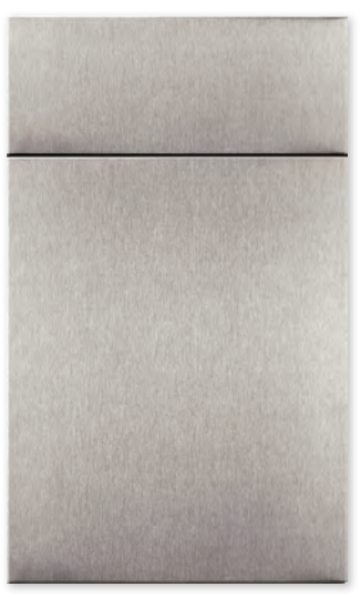
Stainless Steel accent door