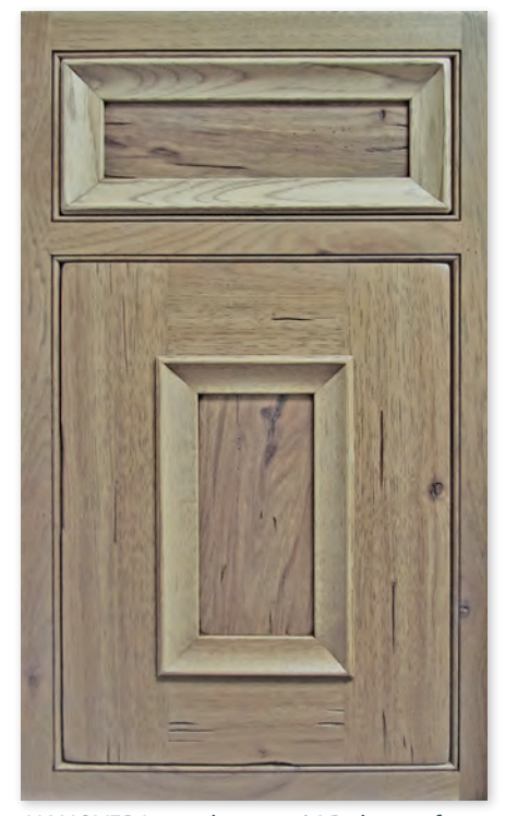
HANOVER Inset shown w/ AD drawer front Signature Driftwood with Van Dyke Brown Highlight, wearing, cracking, rasping, gouging and worm holing on rustic hickory