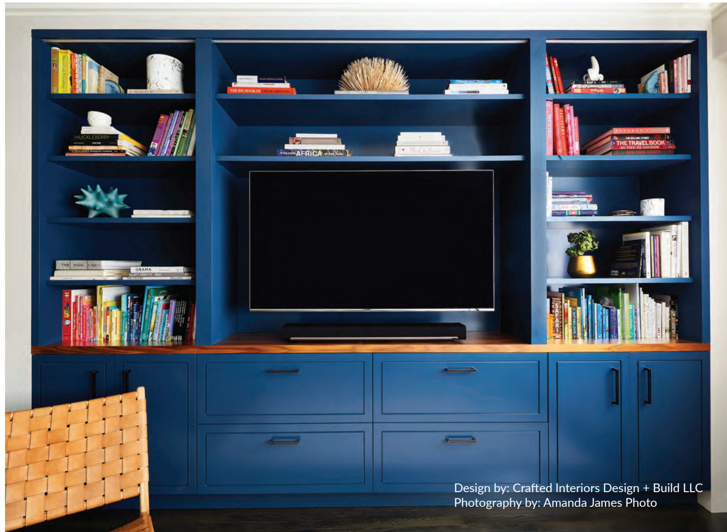
Design by: Crafted Interiors Design + Build LLC