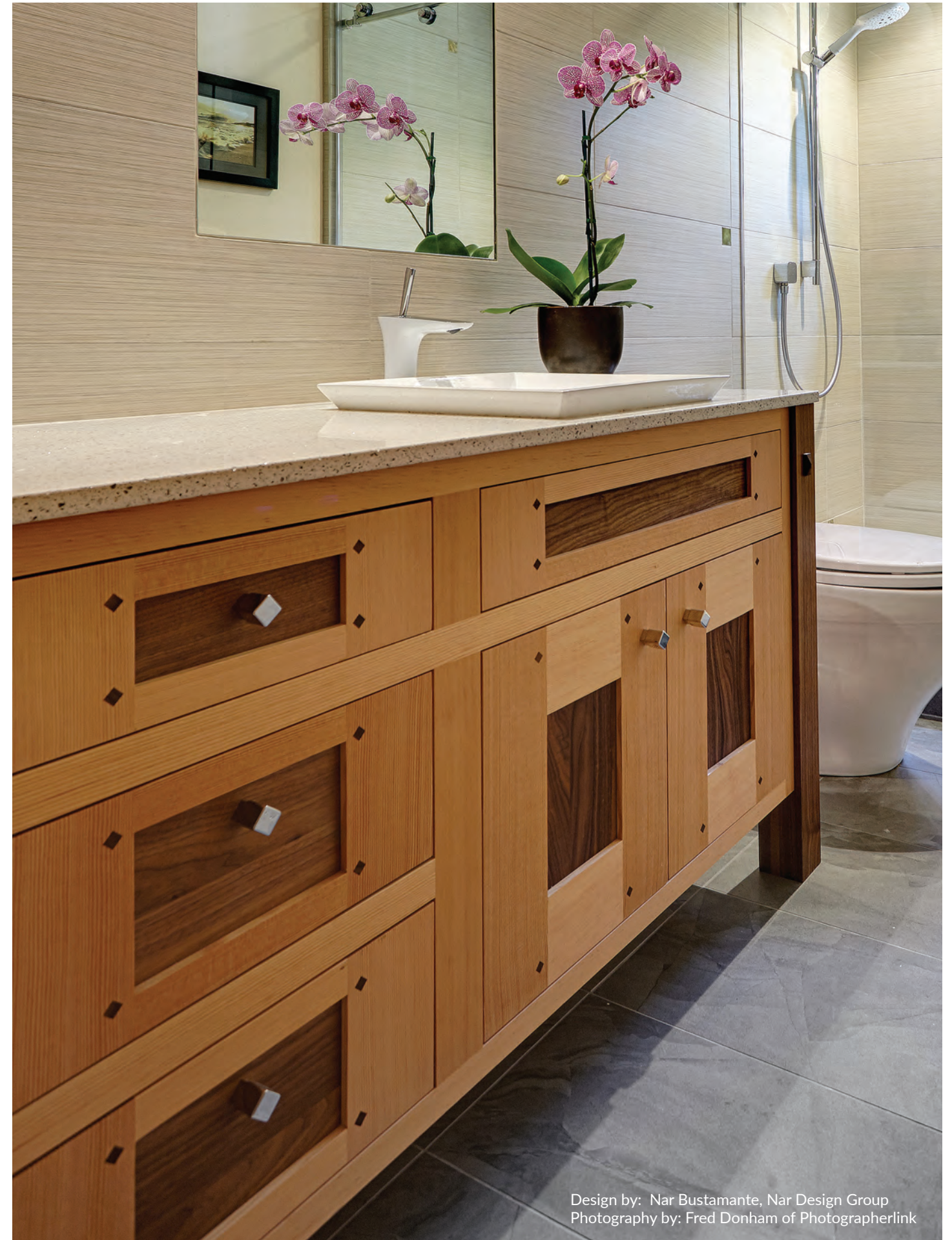
Design by: Nar Bustamante, Nar Design Group

RIGHT: Door Style: Custom Finish/Material: Natural Wood/Substrate Type: Fir & Walnut