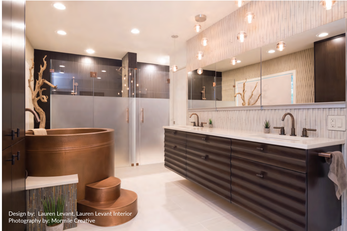
Design by: Lauren Levant, Lauren Levant Interior

BELOW: Door Style: Custom Finish/Material: Raisin & EV Ebony Wood/Substrate Type: Walnut & EV Ebony