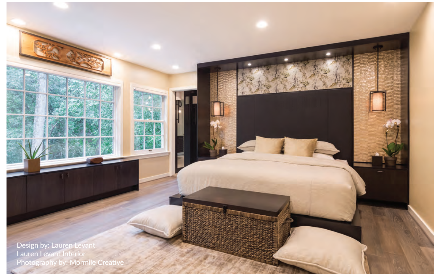
Design by: Lauren Levant Lauren Levant Interior Photography by: Mormile Creative